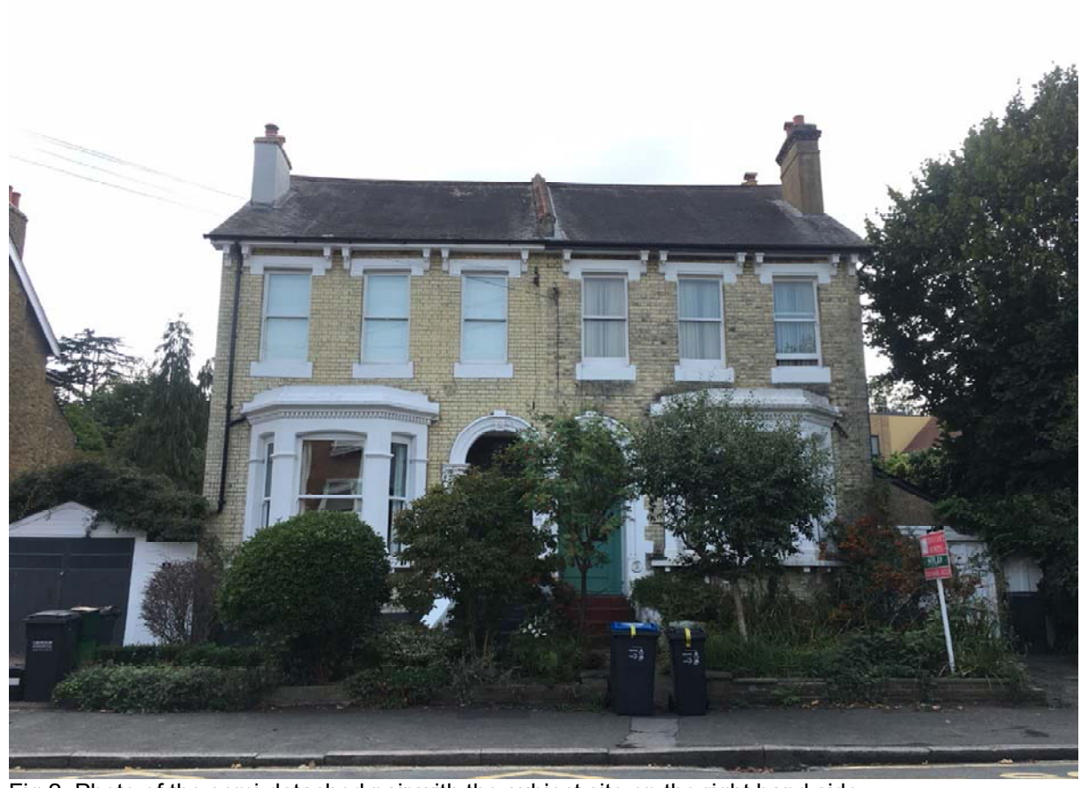
Fig 2: Photo of the semi-detached pair with the subject site on the right hand side